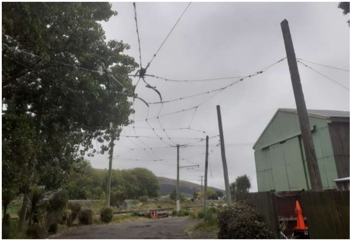
ABOVE: The new right-hand points installed in the overhead behind the Trolleybus Shed.