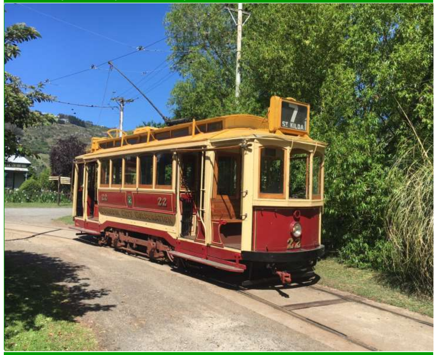
Issue 53 – December 2020

Kitson Boiler Update #24 Lottery Grant November General Meeting More Trolleybus Progress