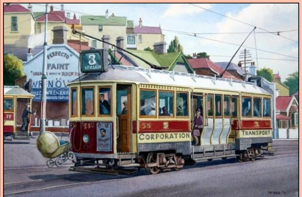
Dunedin's last tram which has just passed the points for the Caversham line beside the Oval. The driver of the Cavity car is returning the baton (tablet) as he leaves the single track hill section past the Southern Cemetery bound for the Exchange.

Russell's painting cost him $1000 framed and measures 350 x 530 mm for the image itself.