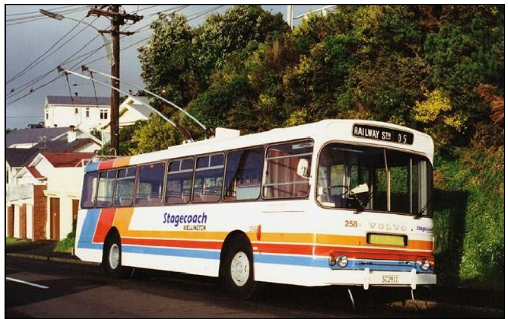
Top: 258 in original Wellington City Transport livery in Aro St.