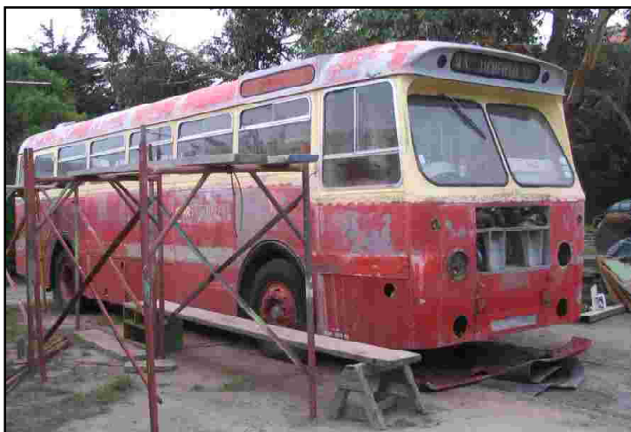
Bus No 452 being prepared for painting.