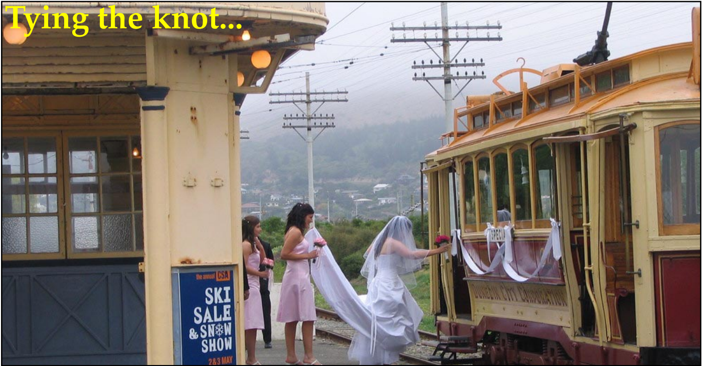
Weddings still bring a bit of business to the tramway and here we see a bride and her retinue boarding the tram for the trip to the township on a greyish day a few months ago.