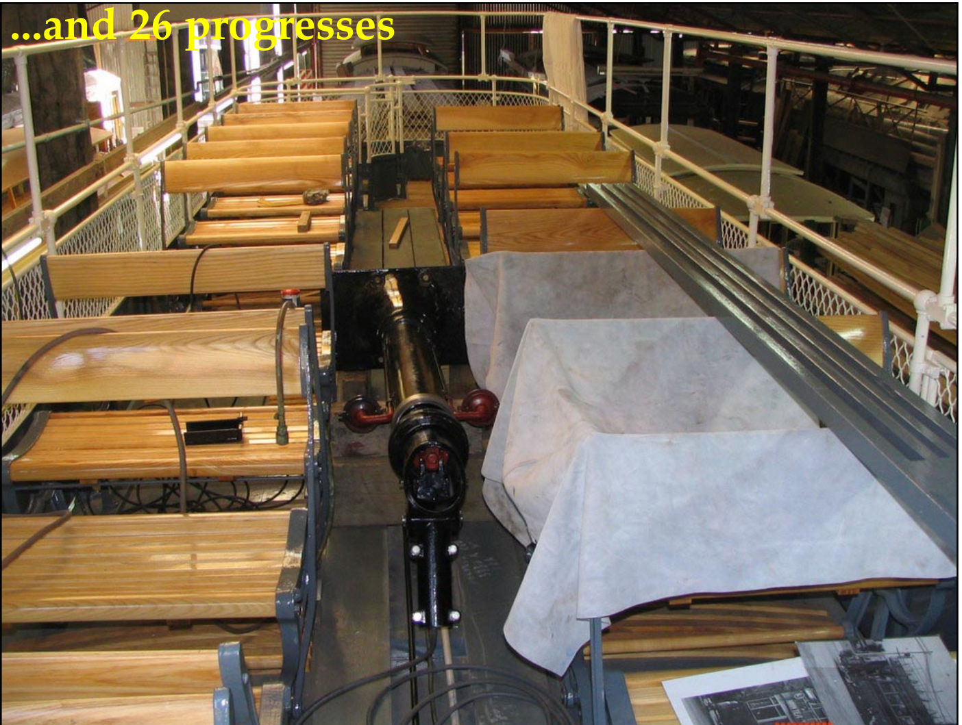
On No 26 work continues on assembling the inside seats and on finishing off the insides of the bulkheads. A new axle has had gear and wheels fitted and the wheels trimmed in the lathe.