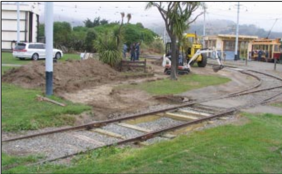
Tar seal is being removed to allow replacement of sleepers under the Gisborne point. The realignment will make trailer shunting safer and easier, and track maintenance easier.