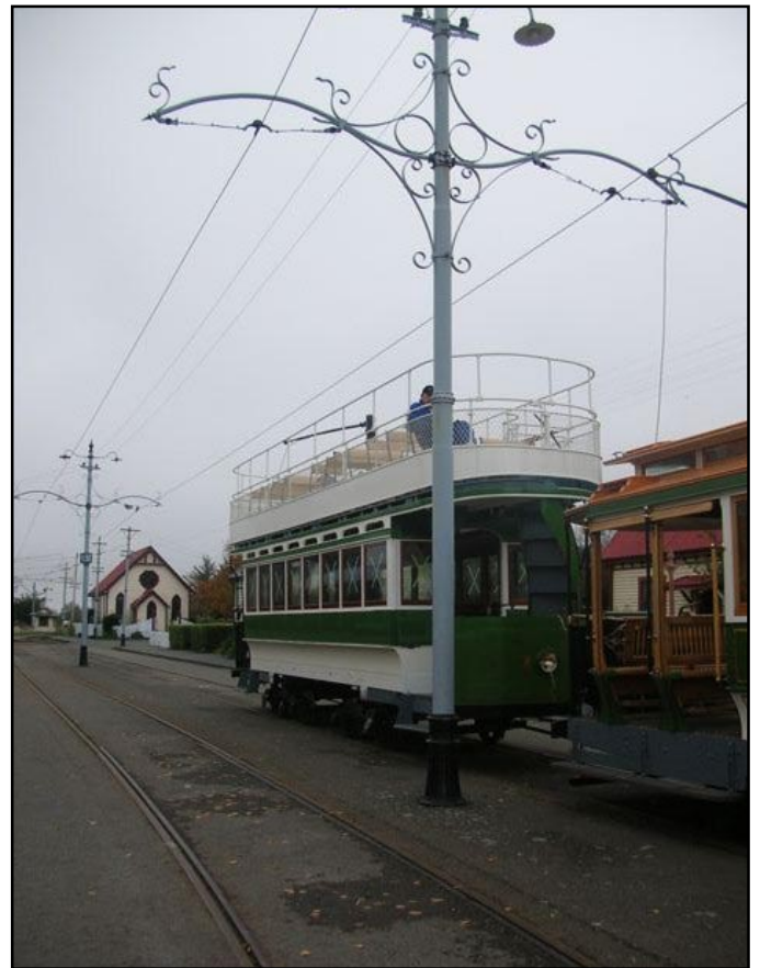
Top: not yet completed and without motors and other running appurtenances and impedimenta, No.26 on stands on display for the FRONZ representatives at Queen's Birthday. Lower photos: the tram on its trial run to the township towed by No.1.