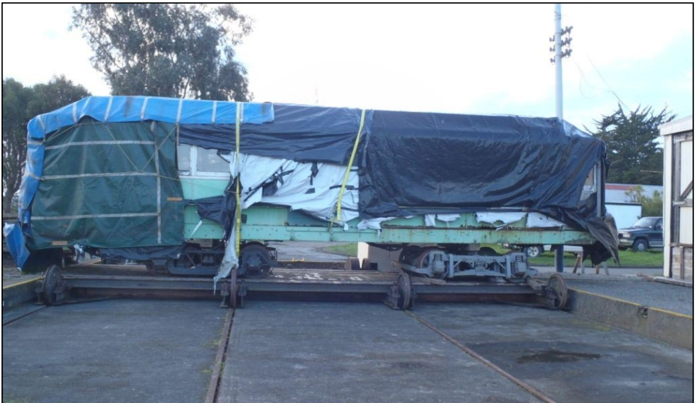
Yank 12 moving on rails for the first time since 1954, albeit on a rather curious and unauthentic combination of bogies. She is being moved to the south side of Tram Barn 1 to make room for Tram Barn 3.

Anyone interested in becoming a Trustee please contact me as above or discuss it with Graeme Belworthy who will pass on your interest.