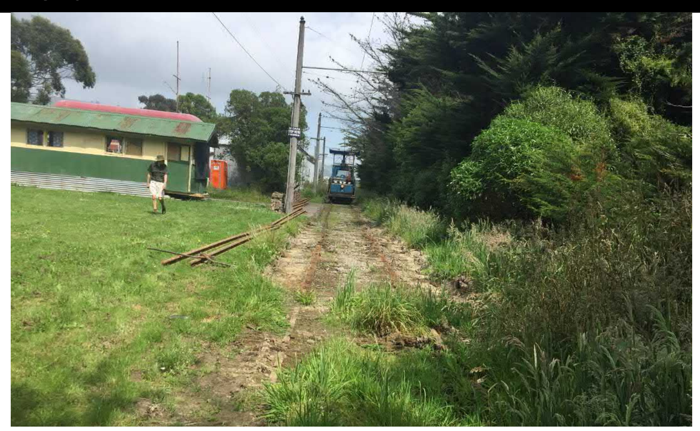
The latest round of track work has been focused on the line past the Cranmer building to the Reserve, soon to be home to 'Brill' 194, which will be positioned alongside fellow tram bach 'Standard' 126. The top photo shows early stages of work with grass scraped off and some rail removed. By 26 January, the trackbed had been dug out and new sleepers placed (below left). A week later, on 2 February, and Ken Henderson was busy supervising reassembly of the track. New ballast will soon follow, and 194 will be moved to its new 'home'.