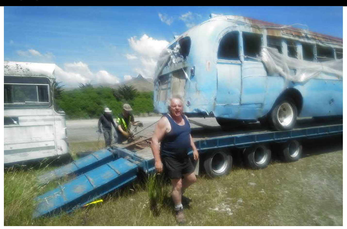
As noted on p.6 above, the ex-NZRRS Leyland Cub was loaded for transport to Dunedin on 21 January 2019. These two photos show firstly the loading process ( above ) and secondly, on the trailer ready to go ( below ). Its departure has been greeted with enthusiasm by members of the Society's Bus Team, who had expressed concerns about vandalism and deterioration during the Cub's long stay at Ferrymead.