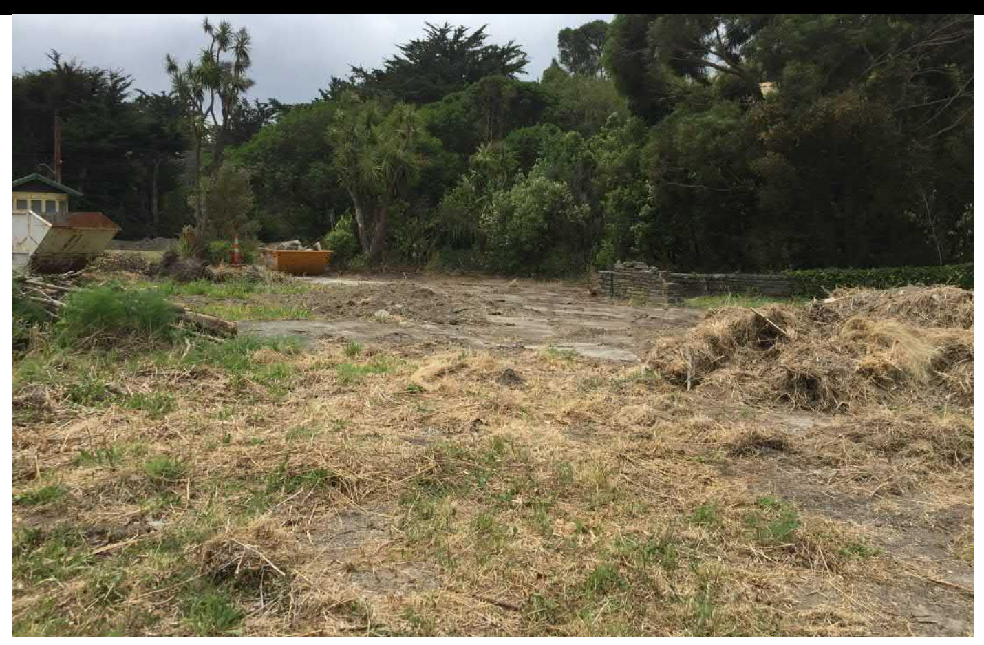
ABOVE: Site clearance work for the new Diesel Bus Shed, as of late last month. Looking north towards 'Standard' 126 at top left. Photo: Dave Hinman.

BELOW: Current work on Mornington grip tram 103 with the cabin framing now going back up under the watchful eye of Don McAra. Photo: Dave Hinman.