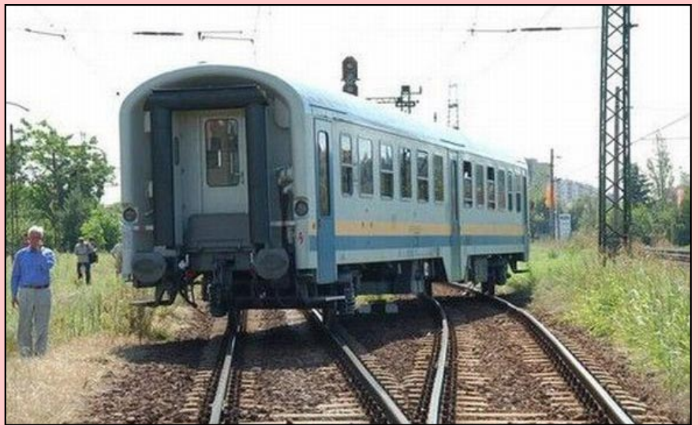
This isn't a tram but you get the idea. Things could have been a lot worse.

Therefore when stopping and changing direction make sure that all vehicles are clear of point work