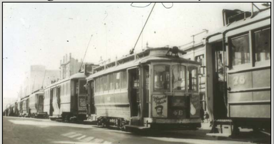
Dunedin dwellers will be able to identify the location of this photo showing an impressive line-up of trams. In the foreground we have a Caversham ("Cavvy") car, built originally as a trailer to the plans of the Christchurch Standard trailers and later motorised. In front of that is a Bobtail car No 48 and in front of that a Sydney Bogie. Next is what appears to be a box car like our No 11 and then another Sydney Bogie.