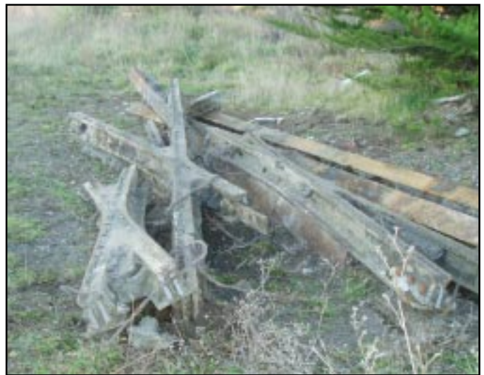
Top left: old special work at the High Street/Cashel Street intersection. Top right: track bed being built from Cashel Street into Oxford Terrace. Above left: High Street/Cashel Street. Above right: special work from the High Street/Cashel Street intersection at Ferrymead.