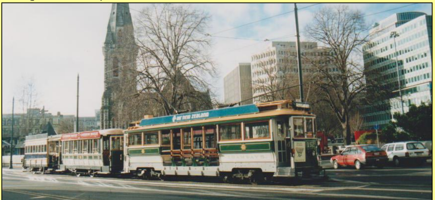
17 July 1995. The only occasion when a tram has hauled two trailers on the City Tramway—with your editor at the controls. It was an experiment to see whether two-trailer operation would be feasible for special occasions. The powers that be were not totally impressed because of the length of the consist and the time taken to clear intersections and traffic lights.