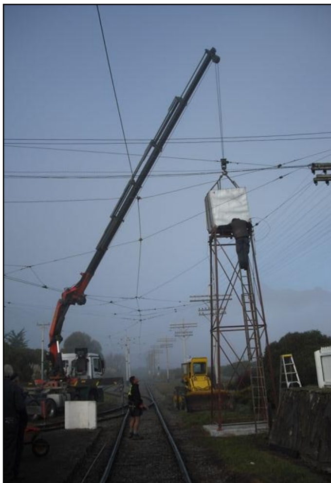
On a foggy Saturday, the new tank stand to supply water for Kitty's thirsty boiler was stood up. When commissioned, it will enable Kitty to be revictualled at the platform instead of having to be withdrawn to the side of the tram barn..