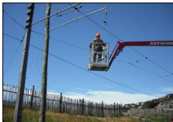
Top: the auger digs the hole for a new pole.

This vehicle now has the platform fitted to the tower. Graeme Richardson and Brian Fairbrass have fitted the deck on this and Murray Sanders is fitting the access ladder and handrails to this tram. The tower will prove extremely useful raising the overhead for 26. Some portions of the tramway are not road vehicle accessible.