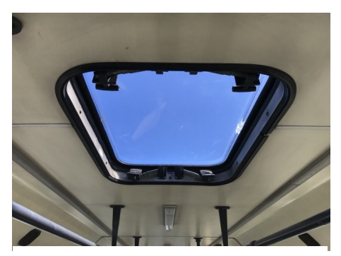
Showing the new roof window in place.