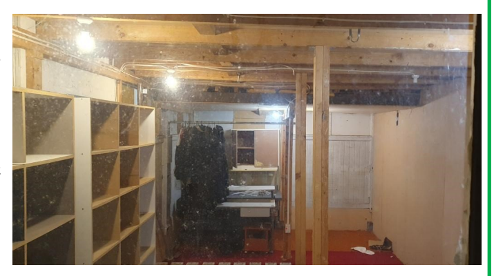
(Mid Nov 2023) – Photo taken through the now removed windows showing the room after most of the contents were cleared out , but before the ceiling was removed.