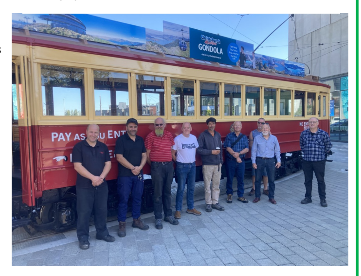
178 posing with some of the CTL and HTT staff. The HTT staff had come in for a ride on 178 on CTL metals after the restoration.