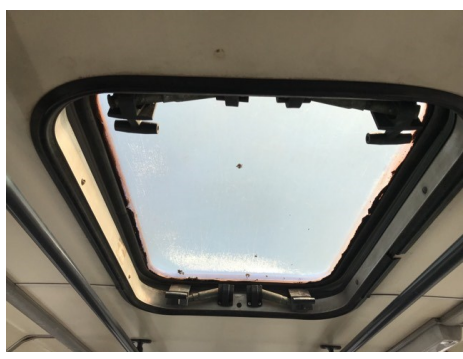
Before the roof window was replaced.