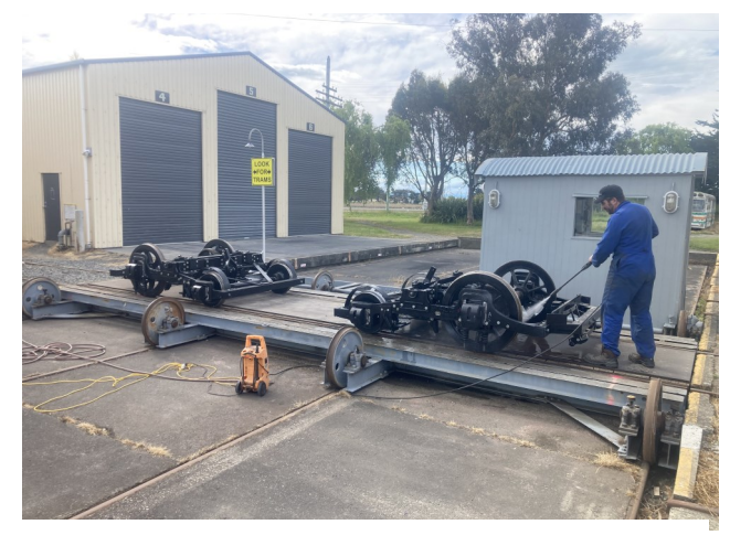
Alan Hinman waterblasting the trucks before painting.