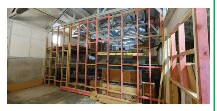
This photo shows the final wall fully framed up. All the timber in this wall is fully borer treated (H1.2)

archives room next door, (b) cladding the new framing - probably with gib wallboard, remediating the other existing walls and also fitting the ne door in the south wall, (c) fitting a ceiling, and (d) installing services such as lighting, power etc. We are also intending to future proof the flooring to allow for mobile shelving to be installed in this area in the future.