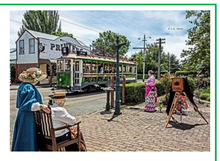
Tram 24 passing the "Friends of Ferrymead" photo shoot on 16th December.