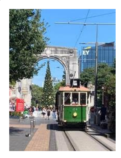
Tram 24 in Cashel Mall just heading away from stop 4.