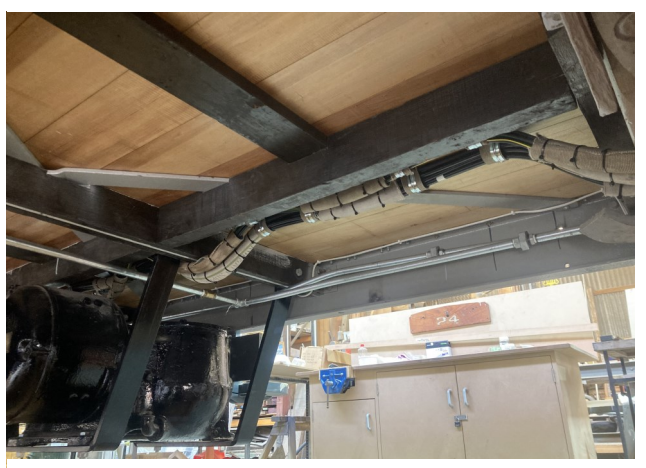
The new piping and wiring in place under the car.