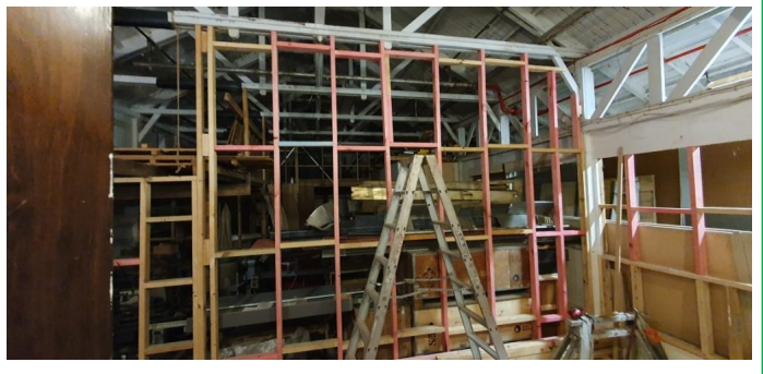
The lower 2 photos show "work in progress" during installation of the new full height wall framing between the archives area and the storage area behind, plus a closeup of the area (left of the photo) where the mezzanine floor used to protrude into the archives area.